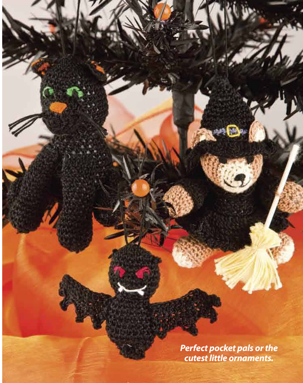
Perfect pocket pals or the cutest little ornaments.

Rnd 1: Starting at top of head with black, ch 2, 6 sc in 2nd ch