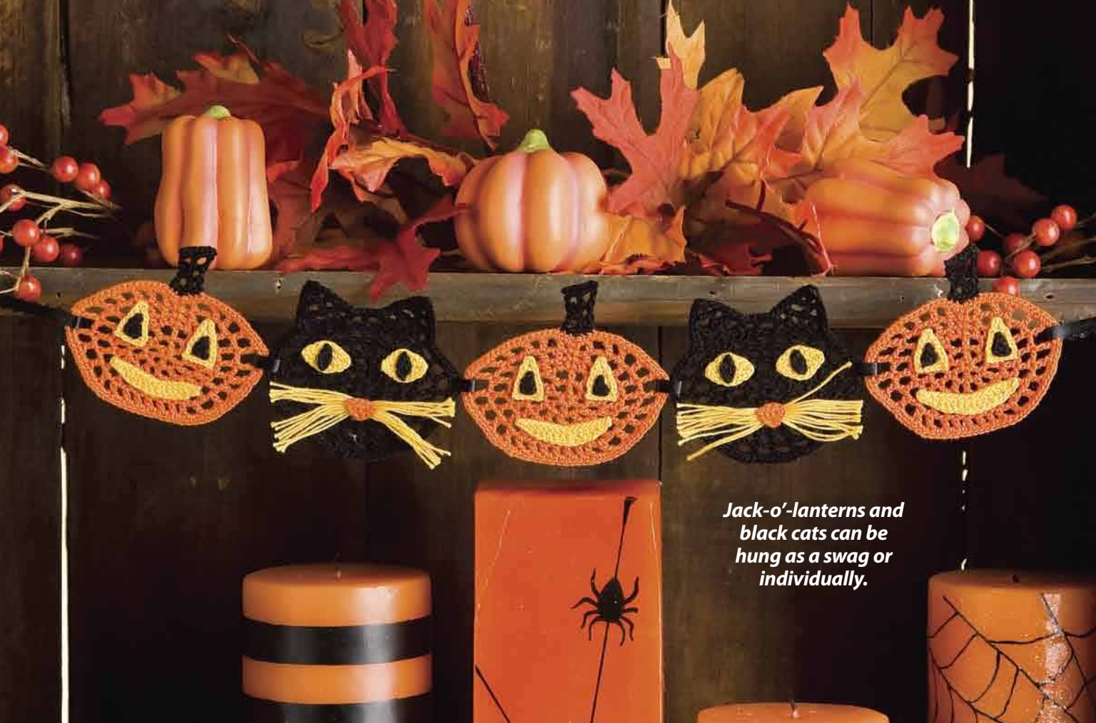
Jack-o'-lanterns and black cats can be hung as a swag or individually.