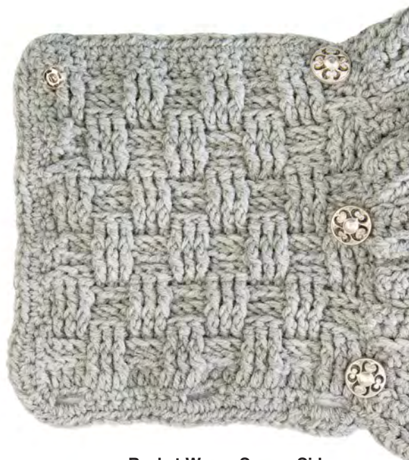
Basket-Weave Square Side

Note: Buttons shown in light gray are sewn on opposite side of Cowl with edge of Diamond Square.