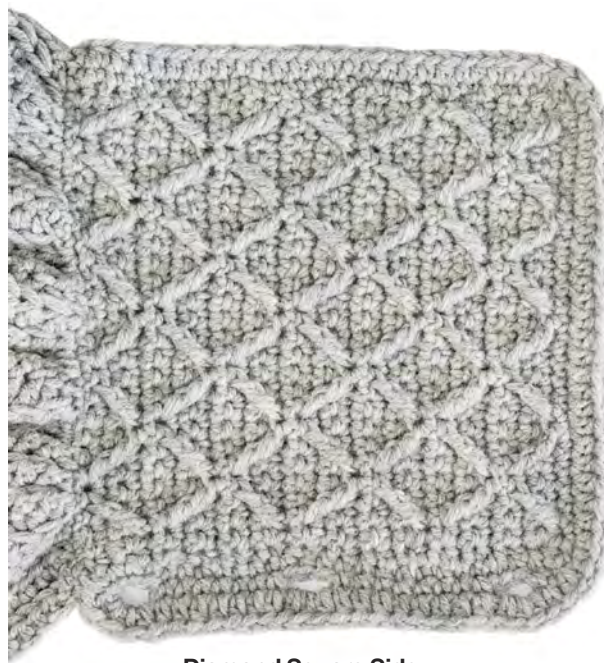
Diamond Square Side